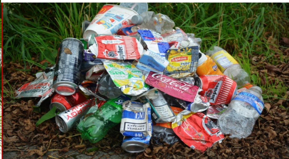
The kind of litter discovered on our last litter-pick event in mid-September