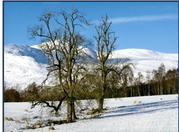
Winter on Black Isle